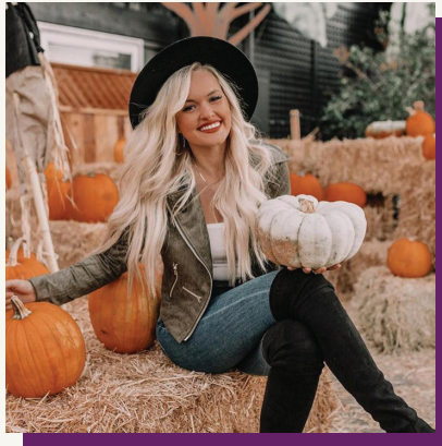
@maddieperry123 164k+ Followers