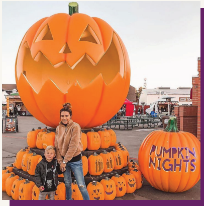
@hellofashionblog 1m+ Followers